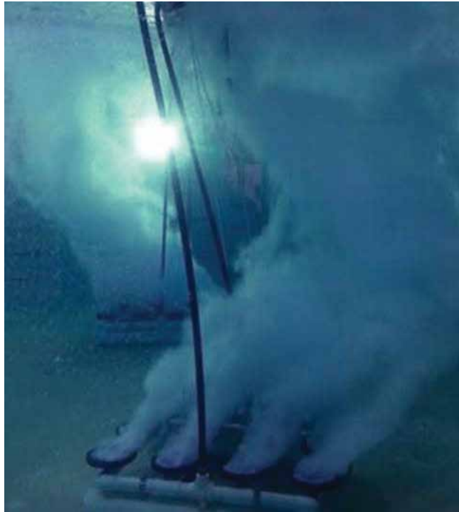
Image displays the Aire-O 2 Triton in operation providing mixing and aeration, as well as increasing bubble retention time from the diffuser grids and providing improved mixing through the water columns.